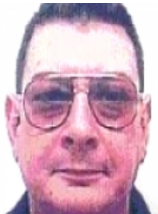
Jean Louis DAVID